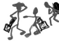
The Travelling Brethren