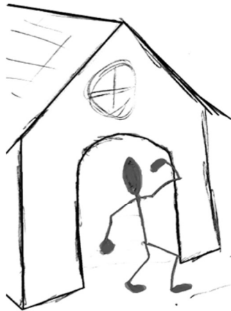
Gaius The Beloved